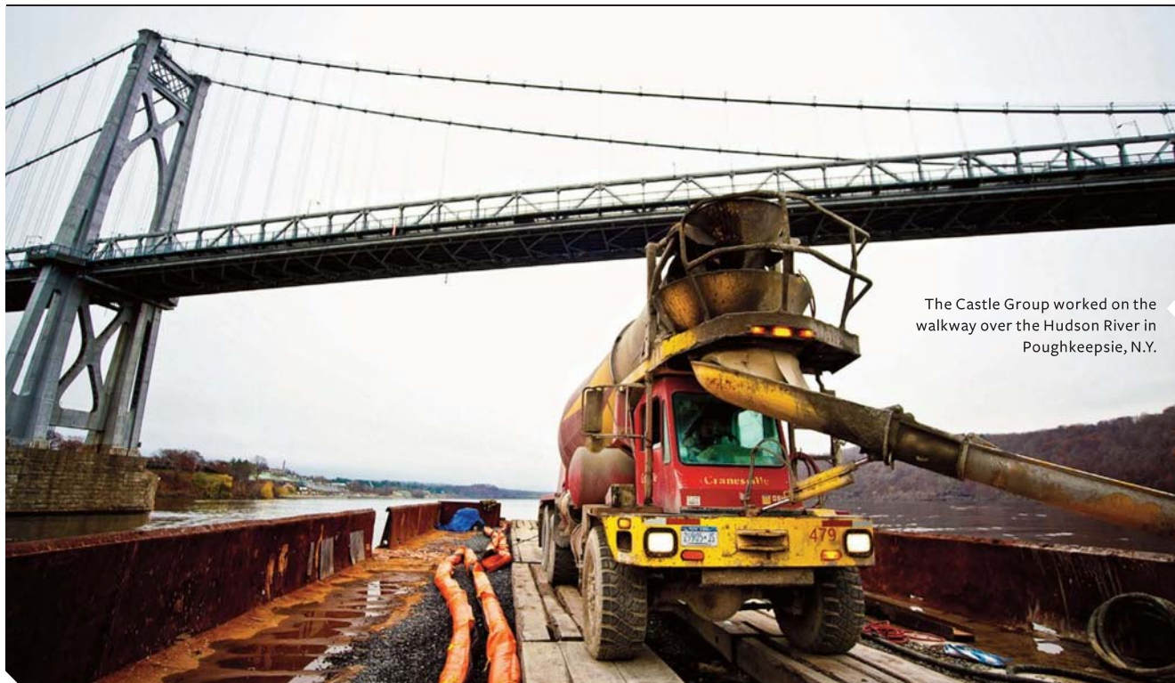
The Castle Group worked on the walkway over the Hudson River in Poughkeepsie, N.Y.